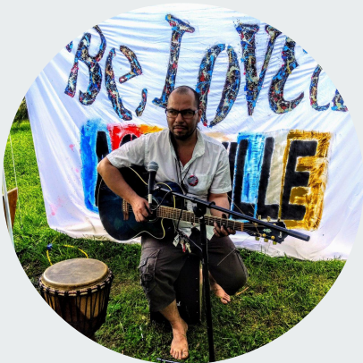
Ponkho Bermejo BeLoved Asheville

appears on the schedule ://: decarceration as the new normal